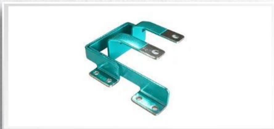
New Energy Busbar