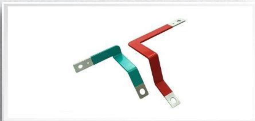
Power Grid Busbar